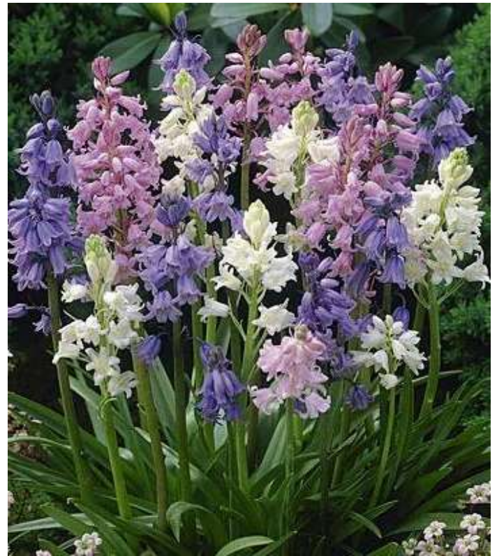
Spanish Blue Bells Mixture Hyacinthoides hispanica

Snowdrops peeking through breaks in the snow are one of the first signs of spring! Deer- and rodent-resistant, these bulbs can naturalize into drifts that return for years. Snowdrops are more tolerant of soil with a bit of moisture than other bulbs. Sun to part-shade. Ht. 5-8". March/April. 10 bulbs for $10