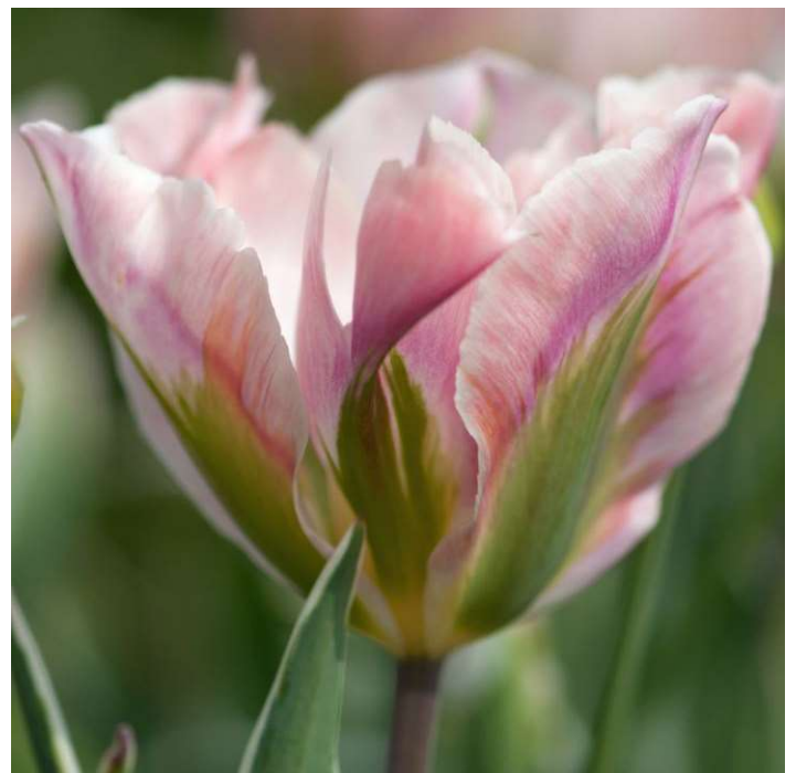
Tulip 'China Town'

Deep burgundy with high-contrast copper petal margins that mature to apricot-pink or apricot-yellow. Ht. 18-20". April/May. 10 bulbs for $10