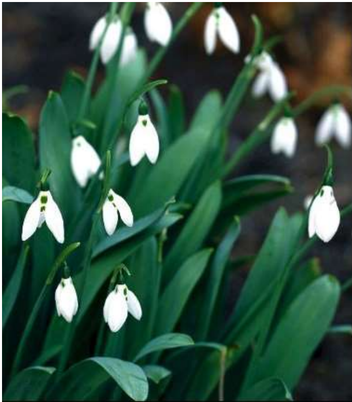
Snowdrop Galanthus woronowii

Snowdrops peeking through breaks in the snow are one of the first signs of spring! Deer- and rodent-resistant, these bulbs can naturalize into drifts that return for years. Snowdrops are more tolerant of soil with a bit of moisture than other bulbs. Sun to part-shade. Ht. 5-8". March/April. 10 bulbs for $10